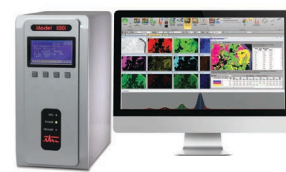
EDS Detector Electronics