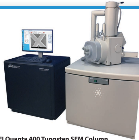
FEI Quanta 400 Tungsten SEM Column Powered by SEMView8000

Our Win10™ SEM inventory is complete with Tungsten (W), Lanthanum Hexaboride (LaB 6 ), and Field Emission (FE) SEM columns.