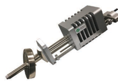
SDD EDS Detector

Whether in-house or in the field, our service engineers are capable of installation on any SEM and provide training as well.